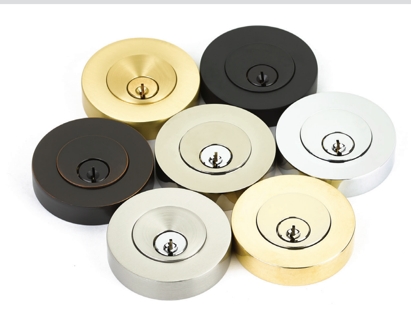
To order: (W) Function + Product Code + Finish + Add Door Thickness to Comments